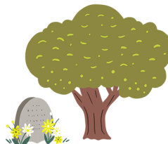
PIERCE BROTHERS WESTWOOD VILLAGE MEMORIAL PARK & MORTUARY

Since most of us are spending more time at home, why not pick up a new hobby like sending letters to friends or journaling. You can find all the stationary supplies you need at Flax Pen to Paper! We recommend picking up a nice pen or a pretty notepad for that person on your holiday list that's just impossible to shop for.