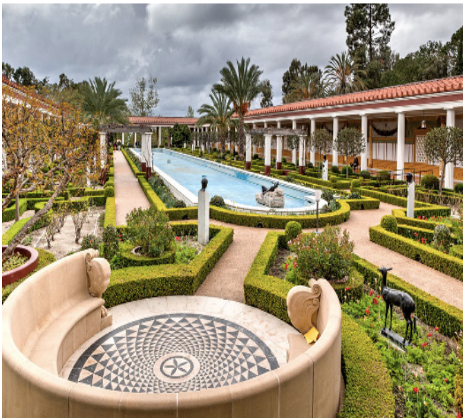
The Getty Villa.

Today the Pacific Palisades is known for its many midcentury landmark homes and for the celebrity estates that adorn the coastline. The beautiful Will Rogers State Beach that stretches along the length of the Palisades attracts beachgoers looking to escape the crowds of Santa Monica and Venice, and the Pacific Coast Highway is a common recreational drive for those who want to take in the gorgeous coastline and breathe the ocean air.